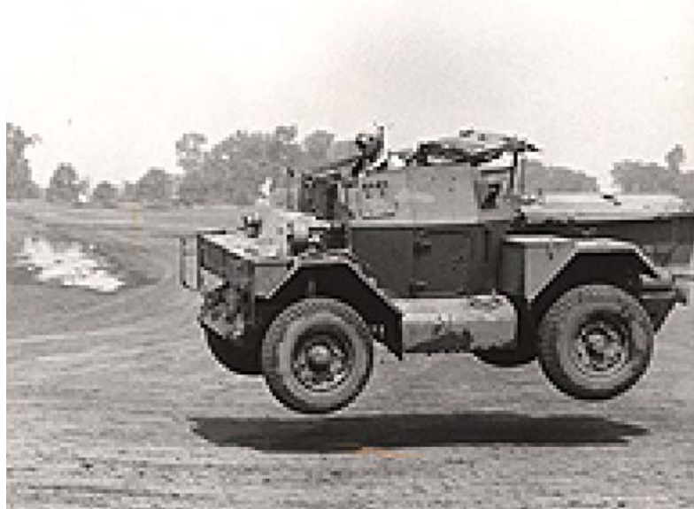
A good shot of the Lynx showing it's off road ability.

The design for a lightweight reconnaissance vehicle was derived from the successful British Dingo.