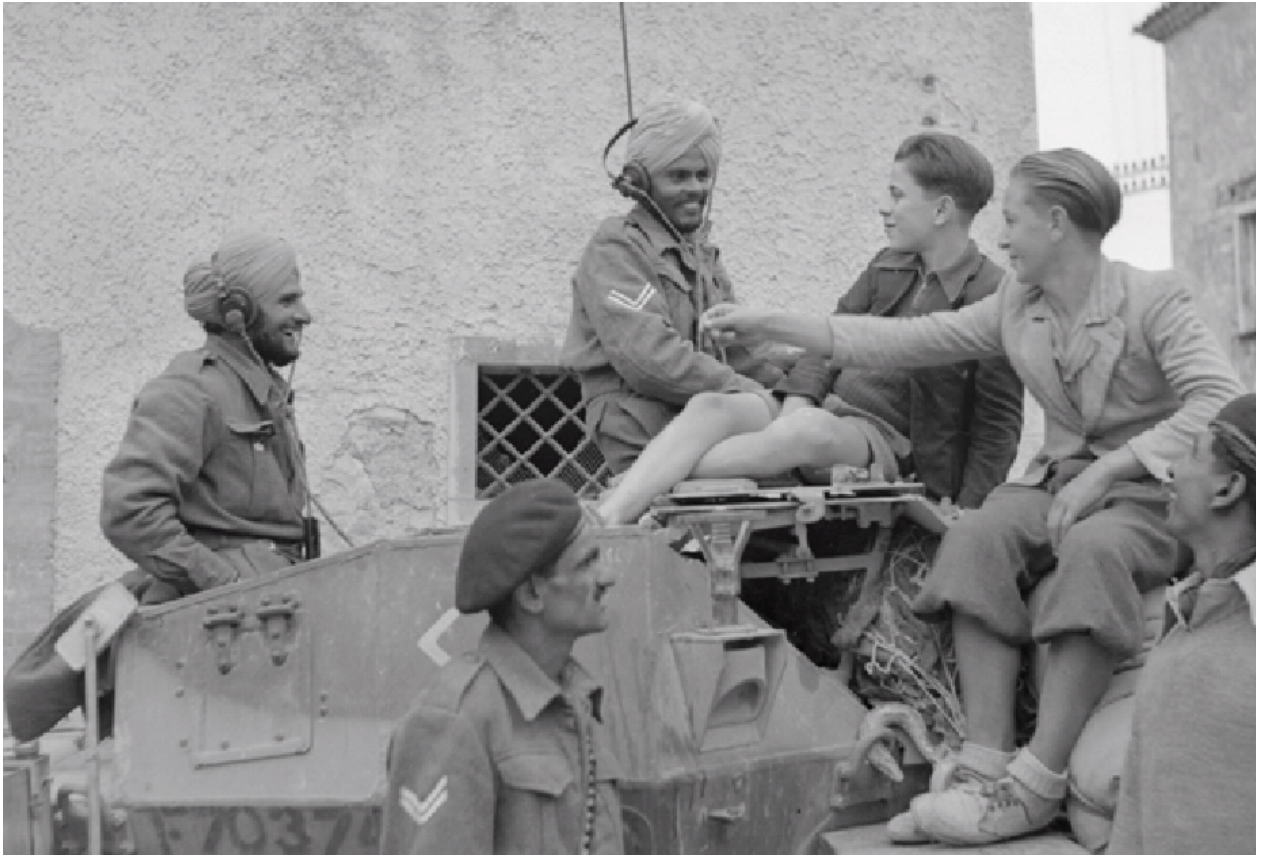
A scout car crew of 6th Duke of Connaught's Own Lancers, Indian Armoured Corps, chat with youngsters in San Felice, during the advance towards the River Sangro.