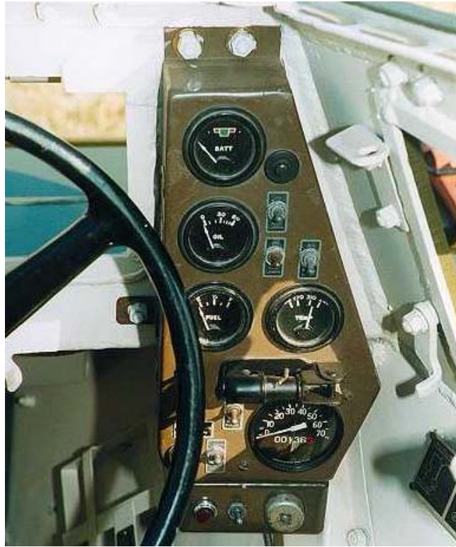
The Lynx instrument cluster is basic CMP, providing the minimum of gauges and controls to ensure efficient monitoring of operational status